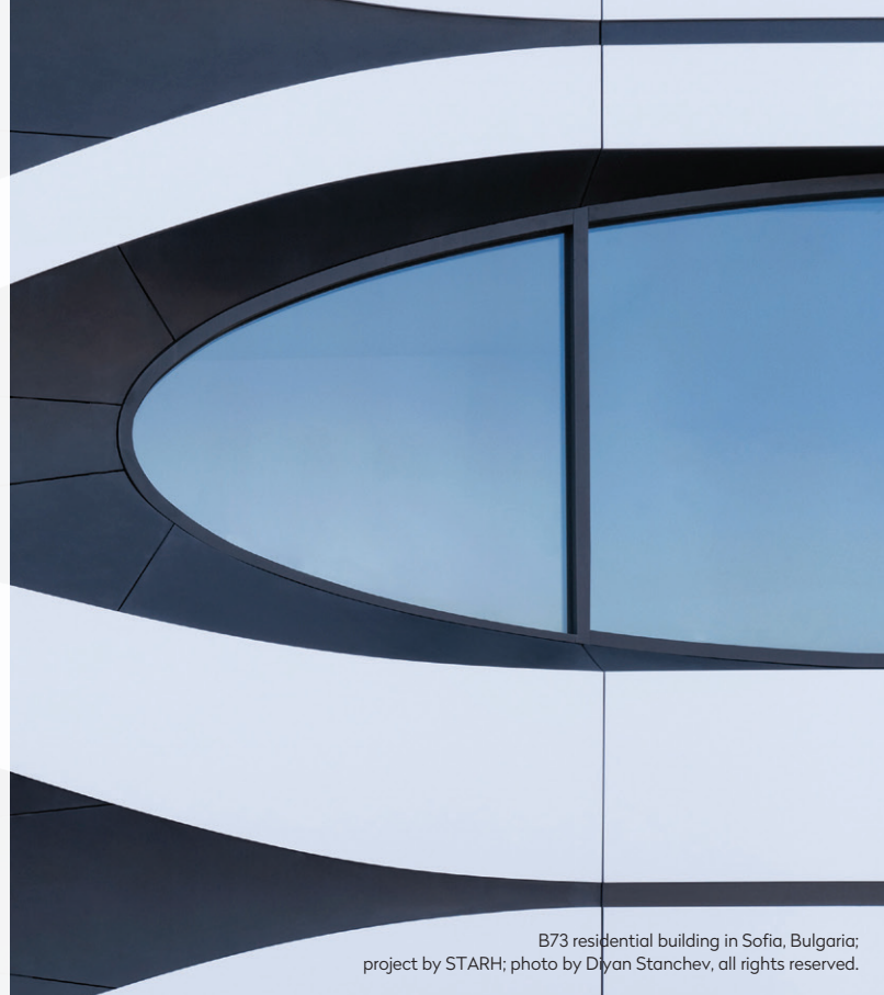
B73 residential building in Sofia, Bulgaria; project by STARH

A facade in Corian® Solid Surface allows the expression of design concepts through a number of techniques and capabilities, combining the longevity and toughness of a homogeneous material with the proven benefits of ventilated facades. Corian® makes it possible to produce two or three-dimensionally formed facade sections as well as shaped sections for corners and lintel elements, therefore creating seamlessly corresponding facade connections.